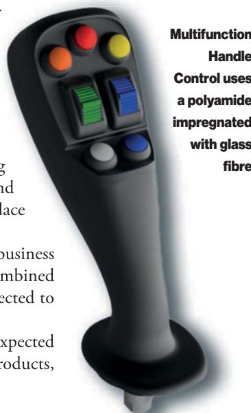
Multifunction Handle Control uses a polyamide impregnated with glass fibre