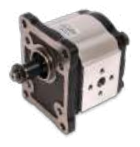
Aluminum gear pumps - single

The site is dedicated to the the engineering and light assembly of aluminum and cast iron gear pumps and motors