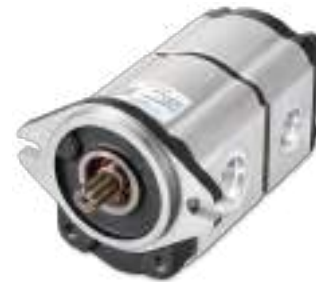
Aluminum gear pumps - multiple